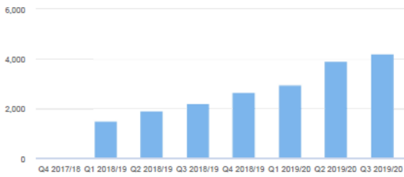
Universal Credit claimants in Tamworth